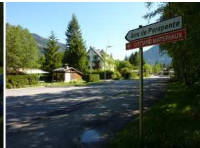
Bois du Bouchet landing field