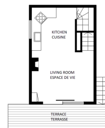
GROUND FLOOR REZ-DE-CHAUSSEE