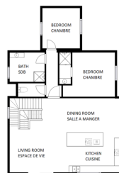
1st FLOOR 1er ETAGE