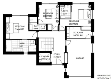
GROUND FLOOR REZ-DE-CHAUSSEE