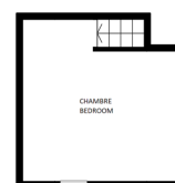
FIRST FLOOR PREMIER ETAGE