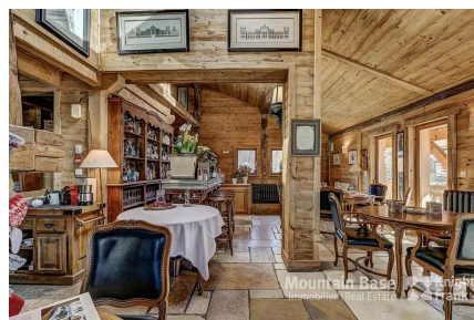
/dining as the et nei