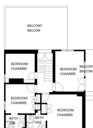
1st FLOOR 1e ETAGE