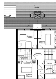
Rez-de-chaussée / Ground floor