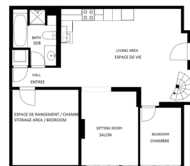
Sous-sol / Basement