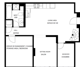
Sous-sol / Basement