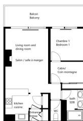
APARTMENT MORZINE - FLOOR PLAN APARTMENT MORZINE - PLAN