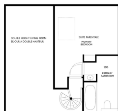
APRIMENT TERCHE - UPPER LEVEL - FLOOR PLAN APPARTEMENT TERCHE - NIVEAU SUPERIEUR - PLAN